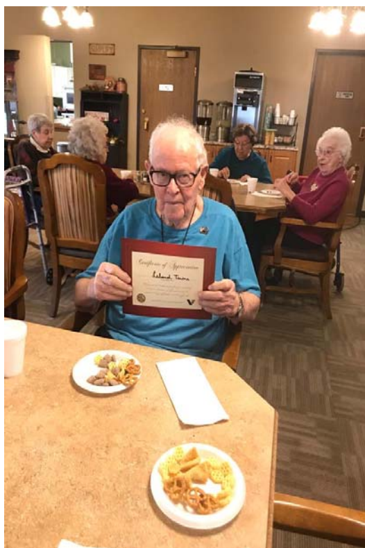
Leland Veteran Pinning