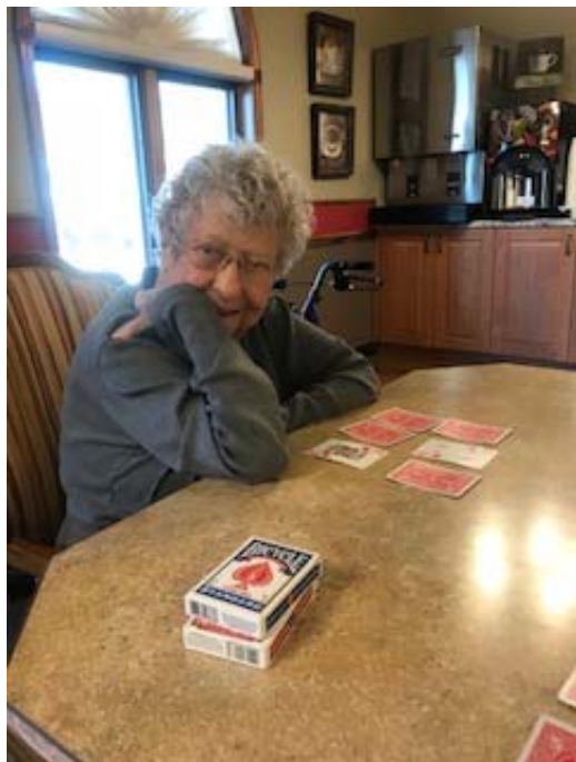
Playing a little 9- Hole Golf