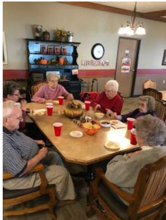
Tail Gate Party!